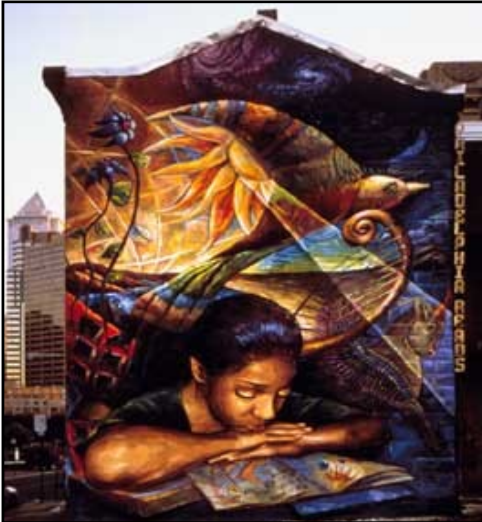
This is an example of their work. It is not the picture that will be on Lotus' wall.