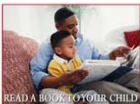
READ A BOOK TO YOUR CHILD